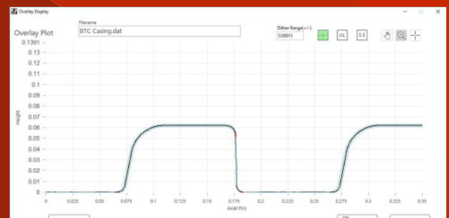
OVERLAY COMPARISON: COMPARES THREAD OVERLAY TO ELECTRONIC THREAD MOLD